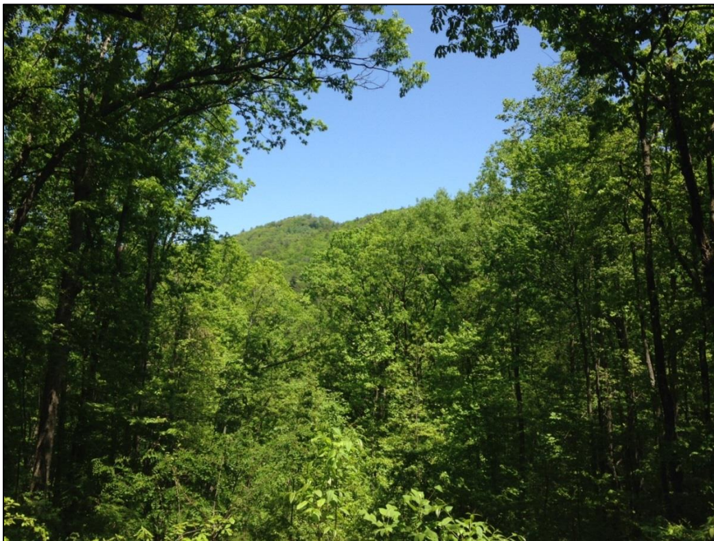
View of Screamer Mountain from the Common Room window

The facilities at the LES Center may not be accessible to all guests. Please contact us for more information at LESCenter@piedmont.edu .